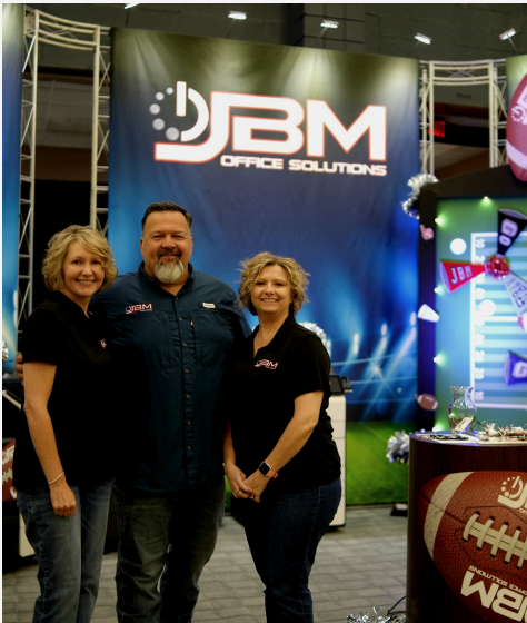
BUSINESS EXPO Cheers to 20 years