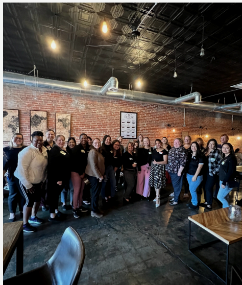
INTERNATIONAL WOMEN'S DAY COFFEE