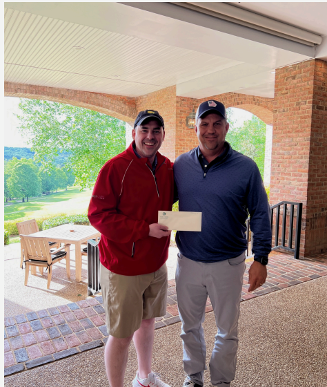
12th ANNUAL GOLF TOURNAMENT